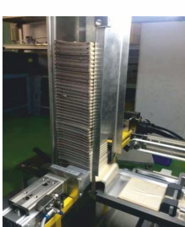
Element stacker unit